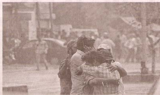
Pakistanis in Lahore mourned on Friday outside one of two mosques of the minority Ahmadi sect that were attacked.