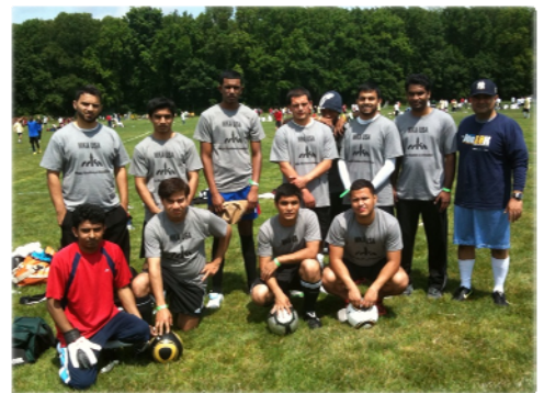
2010 NY Metro Soccer Team

The New York Metro Soccer Team competed in the Annual Islamic Games which took place in the Crossroads Middle School, in South Brunswick, NJ on the weekend of May 28-29 th , 2010. 2 Basketball teams, 1 Soccer team, 1 volleyball team, and 1 flag football team from New York competed in this event.