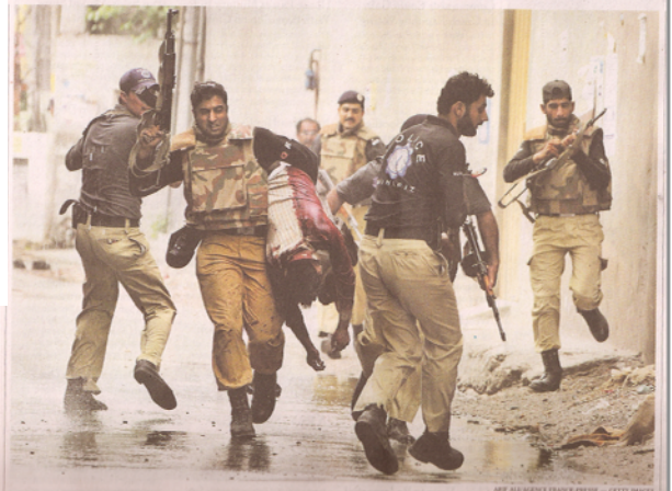
Gunmen Attack 2 Mosques in Pakistan

© 2010 The New York Times NEW YORK, SATURDAY, MAY 29, 2010