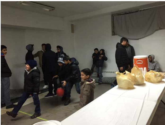
Above: Atfal enjoying after the Musleh Maud day program by playing ball in the basement