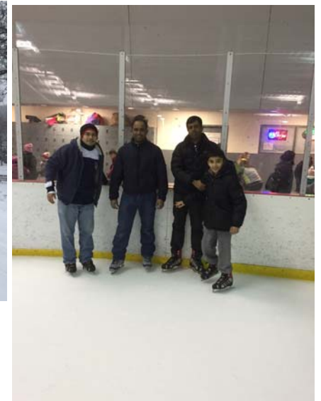
Above: more moment from ice skating rink with Khuddam and Atfal