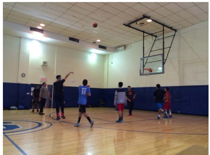
Above: Atfal and Khuddam playing basketball in the indoor gym after Tahir Academy