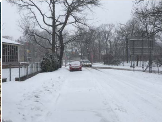
Above: snapshot of Bait-uz-Zafar masjid during one of the snow storm days where Khuddam and Atfal have been coming and shoveling the snow in front of masjid