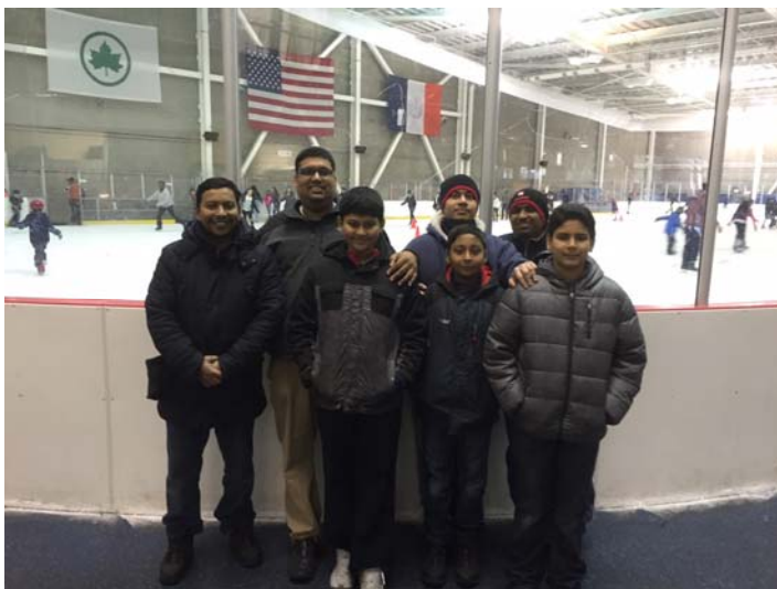
Above: more than 20 Atfal and Khuddam went to Indoor Ice Skating rink in Flushing in a trip