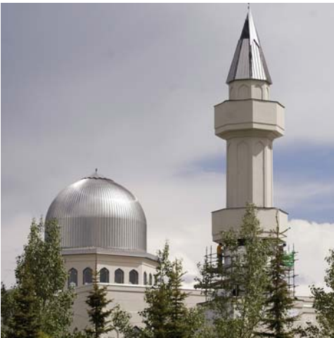
Baitun Nur, Calgary, Canada

However the sale of Baitul Zafar was to bring funds that was to go towards the closing costs and so far we have no concrete offer. Kindly pray so that Allah help us in this matter and go for smooth closing.