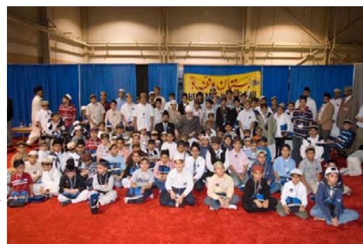
Huzur (aba) with Waqfe Nau children