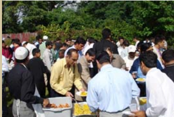
New York Jama'at serving Food for everyone