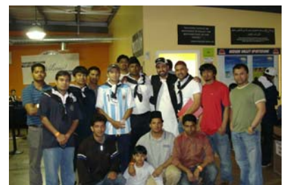
Group shot of all the Bangali Khuddam throughout USA with Sadr MKA