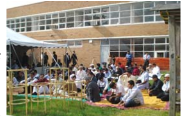
Total attendance exceeded 1,700 as members waiting to pray outside the marquee