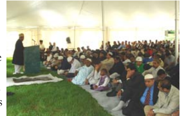
Members listening to Eid sermon outside in Marquee after Prayer