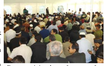
Everyone sitting down after prayer for sermon