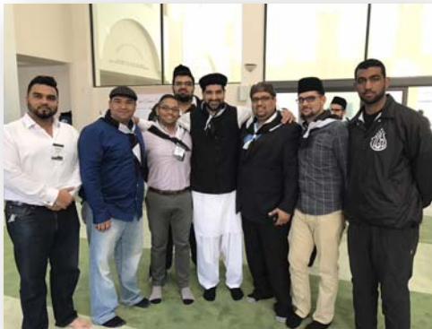
NY Metro MKA Amila members with Sadr MKA USA in Texas during Fazole Refreshers Course

Waqfe Nau website: www.waqfenau.us ; Here is the registration link: http://www.waqfenau.us/ny-Ijtema-registration