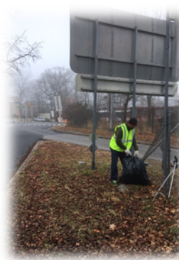
Left: Khuddam performing highway clean up part of Adopt a Highway initiative