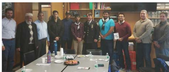
NY Jama'at members meet with local police officers who came to our masjid on a visit to learn more about Islam.

We set out from the mosque at 11 am on a brutally chilly morning. All we brought with us were fliers, smiles, and the will to talk to people as Muslims. 8 young Muslims, the youngest of which was 4 years old braved the cold and set out to spread the message of True Islam. During the hour we spent in front of the Flushing's Queens Library, hundreds of people passed us, saw the sign and even took fliers. All those who stopped to interact with us have us the reassurance that we were doing something incredibly positive and that more Muslims should be out there spreading a message of peace. One woman who stopped by sought to clear up the misconceptions about Islam that have been conveyed through the media. She remarked "I've known about Islam since before 9/11, and the media has completely changed how we see this very kind religion". Her comments struck the chord we were trying to hit. Nothing else mattered, our job was done. Seeing that not all Americans see Muslims as terrorists is the fuel we need to continue to embark on these #MeetAMuslim events. Inshallah Allah will allow us to maintain our smiles every time we go out to talk about Islam.