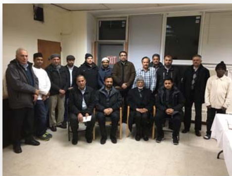
NY Jama'at Amila members with MTA UK officials who were here in New York for a visit