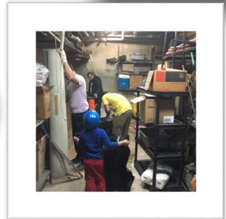
Top Left to Right: Atfal & Khuddam dinner during Sleepover, Atfal sports in gym, khuddam masjid basement cleanup