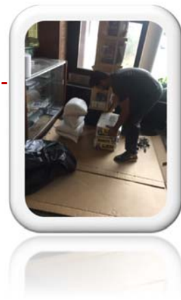
Left: Khuddam cleaning the masjid lobby as part of beautification project.