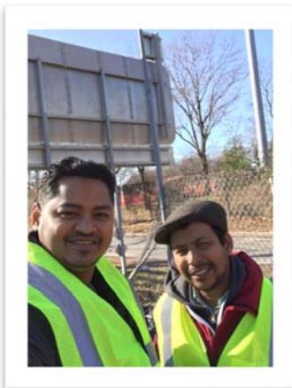
Left: Khuddam cleaning two highways near the masjid, part of the monthly Adopt-a-Highway program.