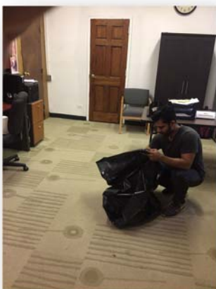
Left: Khuddam cleaning the masjid office to rearrange furniture and cleaning carpet.