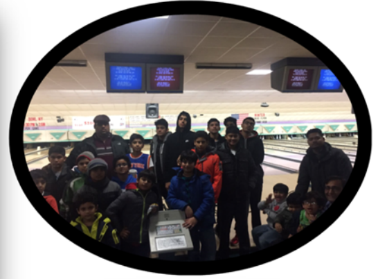
Top Left to Right: Atfal & Khuddam attends the MIST, Atfal & Khuddam goes bowling, group photos @ bowling