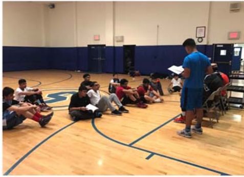
Regional Atfal and Khuddam sports day