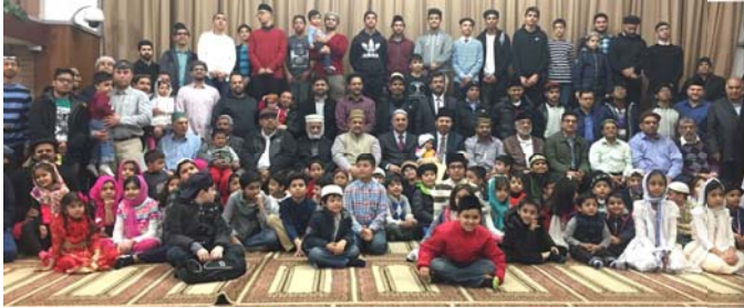
Regional Waqfe Nau Ijtema in Bait-uz-Zafar