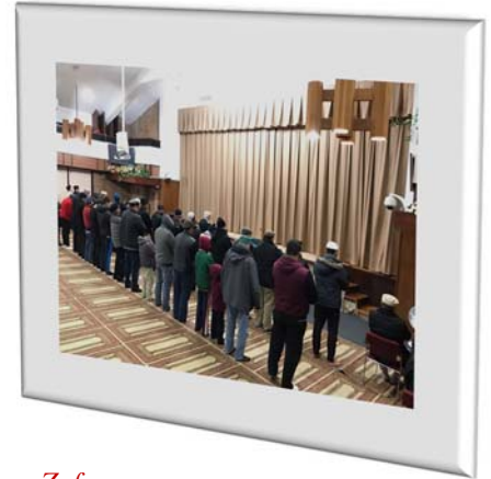
Right: Tahajjot prayer with Fajr prayer in Bait-uz-Zafar