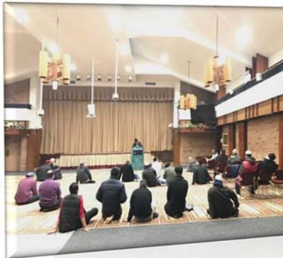
Left: Wednesday Dars after Isha