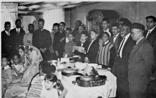
Above are some snapshots of New York Jama'at members from 1050's and 1960's. Ex. USA Amir,