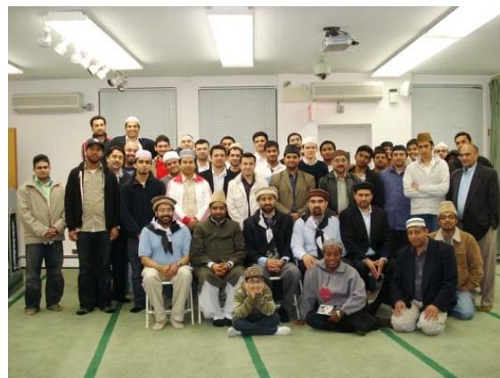
New York Jama'at group photo with Sadr Sahib

Though each majlis spent only a few hours with Sadr Sahib, the interaction will be remembered well into the future. At each stop, he engaged the members in an honest and nonjudgemental discussion as a brother, truly caring for each Khadim's well being. His interest lay in understanding their challenges and opening the door for communication. He laid a foundation for pen interaction and provided the tools for realizing the full potential of being a Khadim. It will be up to the New York Metro Region to build on this foundation.