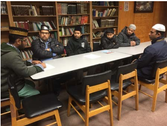
Khuddam meet in masjid every Friday for Isha prayer and holds a book study club where books of Promised Messiah (ah) is discussed

Majlis Ansarullah New York wishes you a very happy new year to you and your family and may Allah makes you happy and prosperous this year (amen), and make a resolve to come to the mosque more often this year.