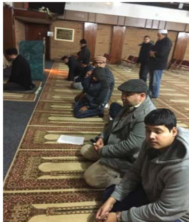
Khuddam meet in masjid every Sunday for Fajr, and go to gym part of Fajr Fit program